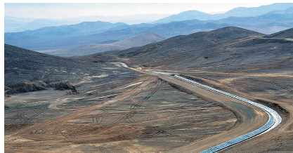
[GSE lined canals help prevent water loss]

Several sections of the canal, which winds down the mountains, utilized a