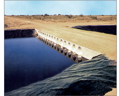
GSE lined canal with incorporated flow control system

Polyethylene geomembranes are commercially available in a range of resin densities and quality. However, GSE uses only the best quality high density (HDPE) and linear low density polyethylene (LLDPE) resins. These resins exhibit exceptional flexibility, strength and durability, as well as excellent chemical resistance. HDPE geomembranes are best for high wear conditions such as exposed applications and LLDPE geomembranes offer extra flexibility.