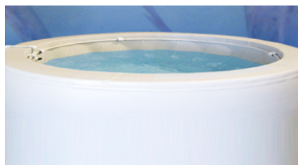
[GSE Aqua Tank]

Effective erosion control is another significant advantage of a GSE lining system. The liner eliminates slope deterioration caused by surface rains, wave action and wind. The liner prevents eroded materials from filling the pond and reducing the volume. In addition, costly erosion repair and dredging are eliminated.